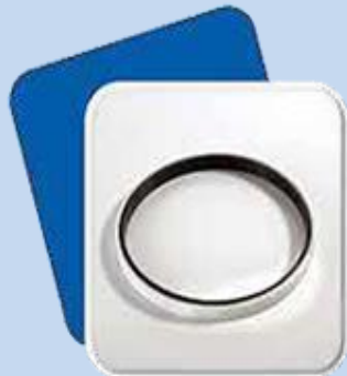
SEALING GAS KETS