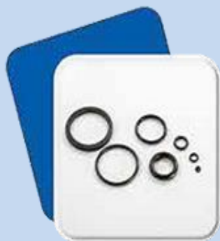
SEALING GAS KETS

Application: BOP equipment Models: hydri, GK Size range: 7 1/16 to 30 inches.