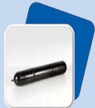
ACCUMULATORS (Bag & Gas Valve)