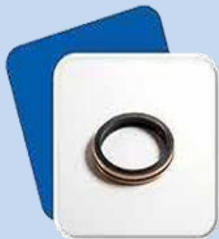
SEALING GAS KETS